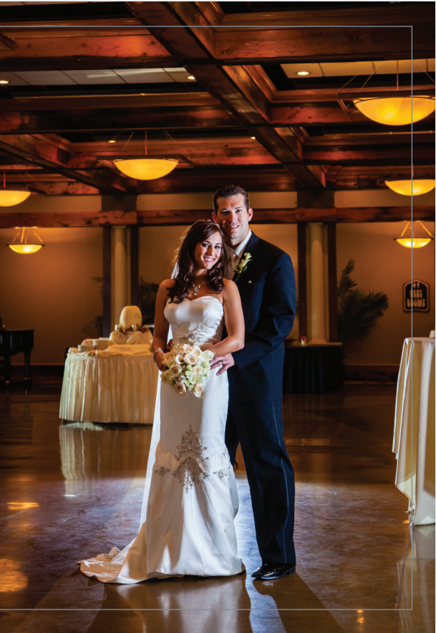
NIEDERMAN FAMILY FARM THE OSCAR EVENT CENTER