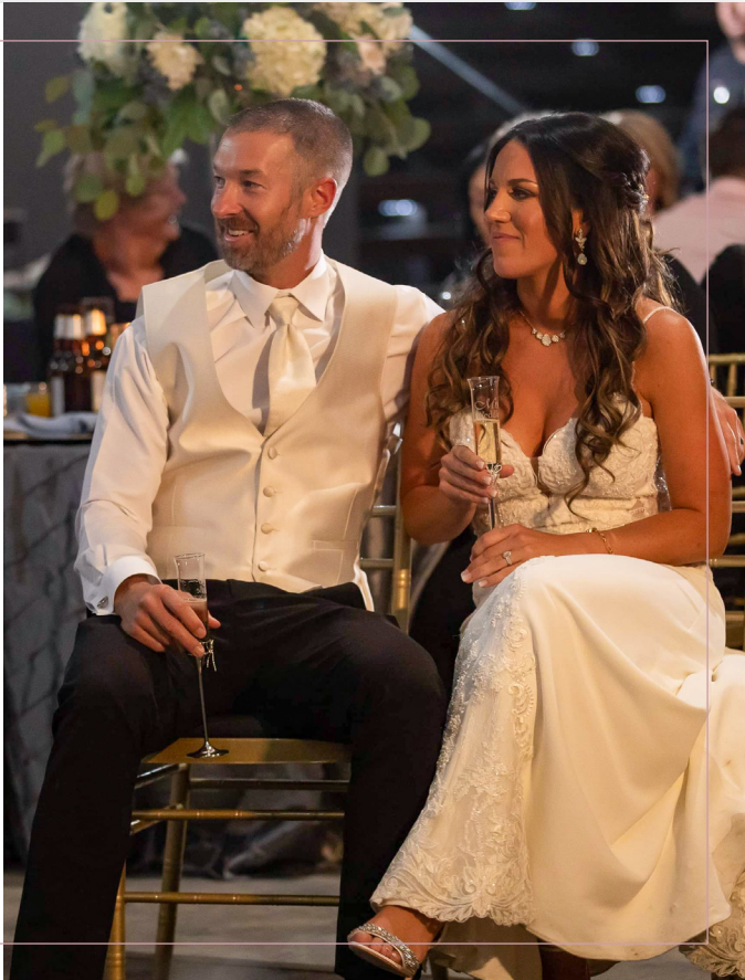
LAKE LYND SAY: DOLCE VITA THE LUXE: A1 STUDIO