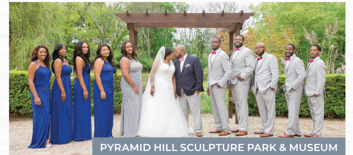
PYRAMID HILL SCULPTURE PARK & MUSEUM