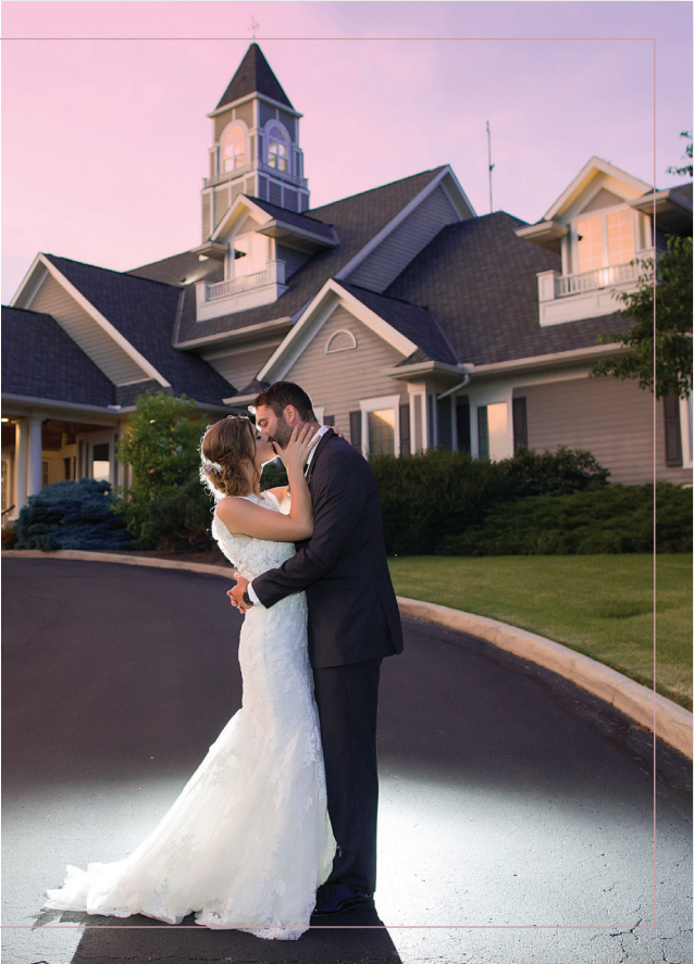
WALDEN PONDS GOLF CLUB WETHERINGTON GOLF & COUNTRY CLUB