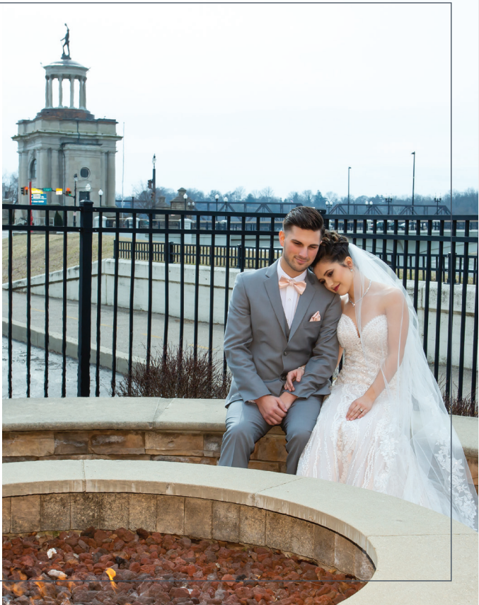
CINCINNATI MARRIOTT NORTH: JEFF SCHAEFER PHOTOGRAPHY COURTYARD BY MARRIOTT HAMILTON: CINCINNATI DIGITAL PHOTOGRAPHY