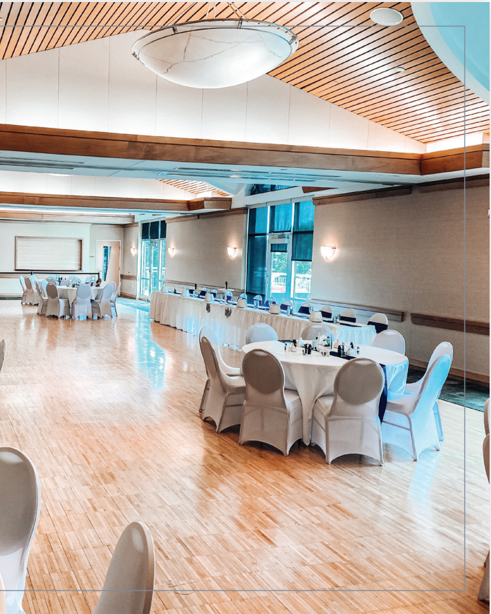
ENTERTRAINMENT JUNCTION FAIRFIELD COMMUNITY ARTS CENTER