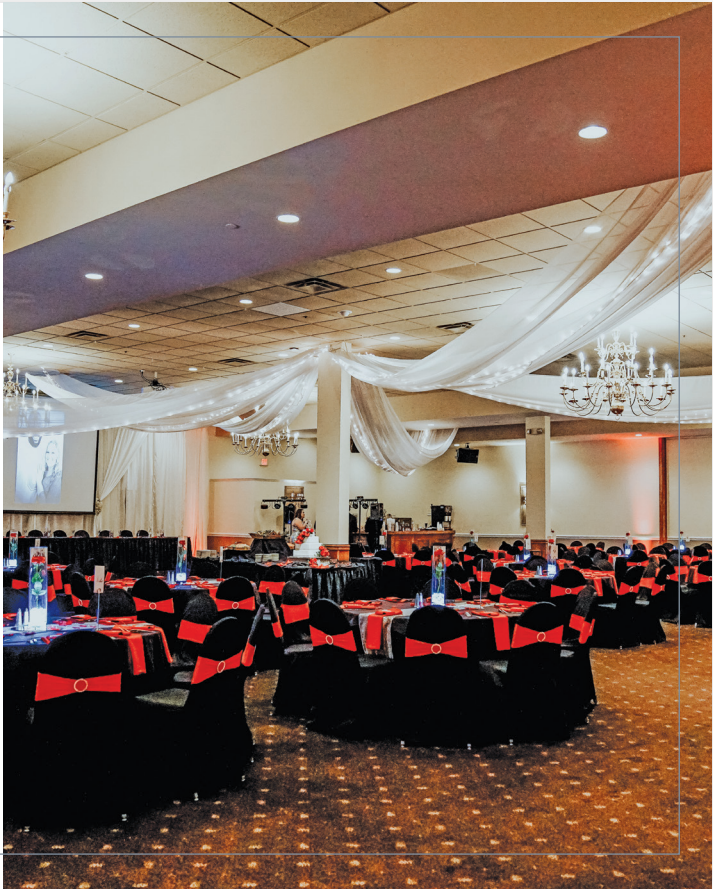
PYRAMID HILL SCULPTURE PARK & MUSEUM RECEPTIONS EVENT CENTER: DOLCE VITA