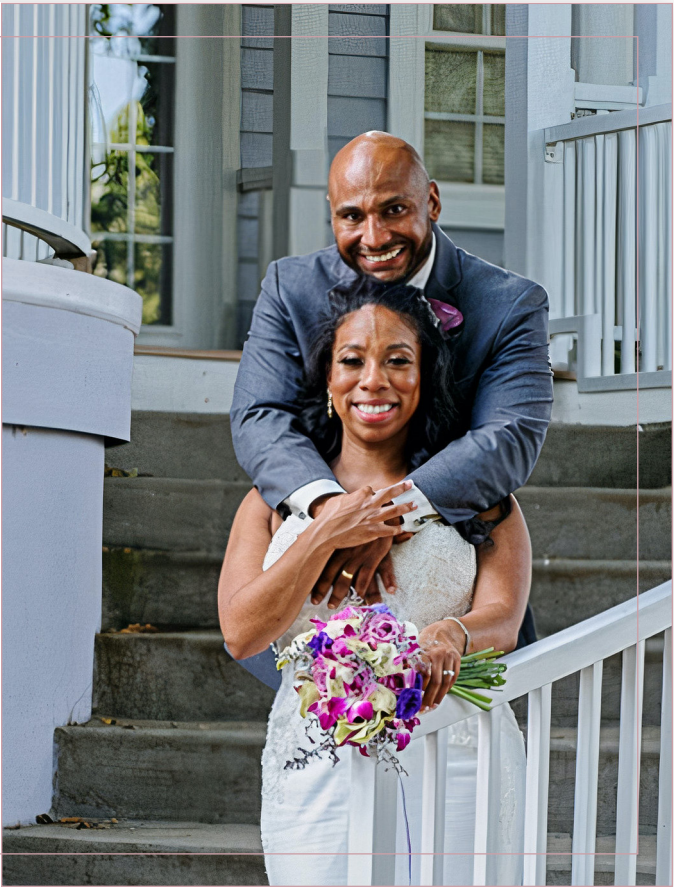
FOP LODGE AT JOYCE PARK FOREST HILLS BANQUET & BISTRO