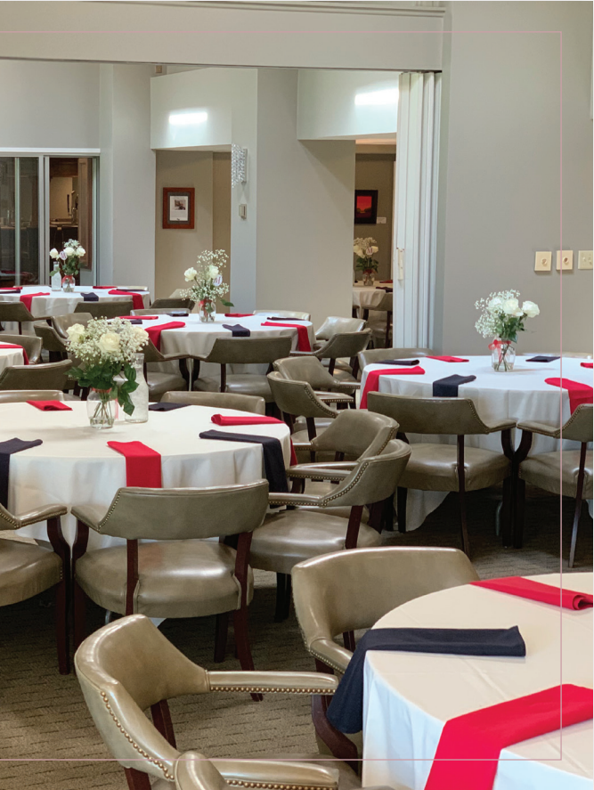
MUHLHAUSER BARN: DOLCE VITA NIDERDALE EVENT CENTER AT BROWN'S RUN: DOLCE VITA