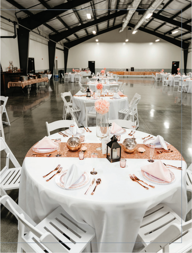
FOUR BRIDGES COUNTRY CLUB THE GROUNDS AT BCF