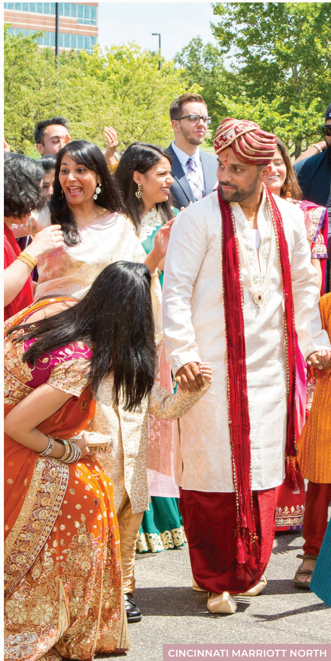
CINCINNATI MARRIOTT NORTH

With a little planning and a great timeline to help, your wedding will come together in no time. We've started you off with a handy list to get you going. Customize this to your own needs.