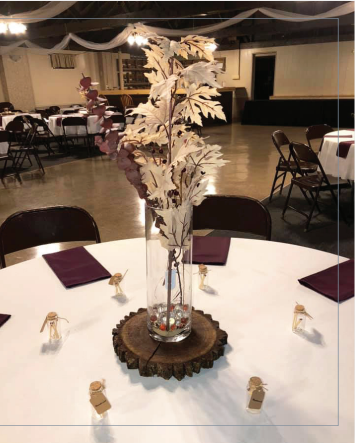
HANOVER RESERVE HEAVEN SENT WEDDINGS