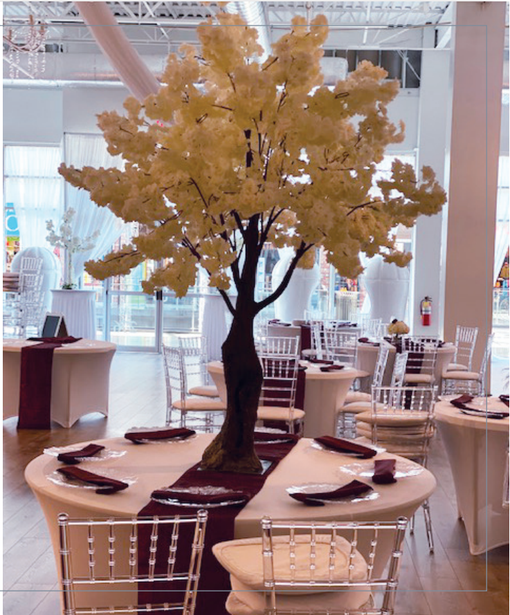
SAVANNAH CENTER: SUGAR LOFT EVENTS