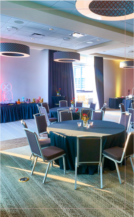
RONALD REAGAN LODGE: SABIN HALL AND UNITY CHAPEL