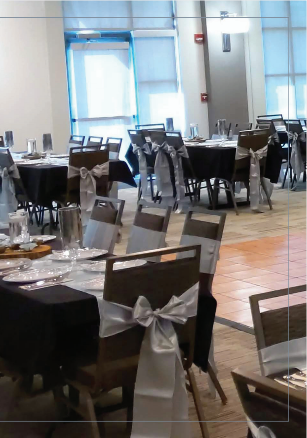
THE ELMS FOUR POINTS BY SHERATON CINCINNATI NORTH