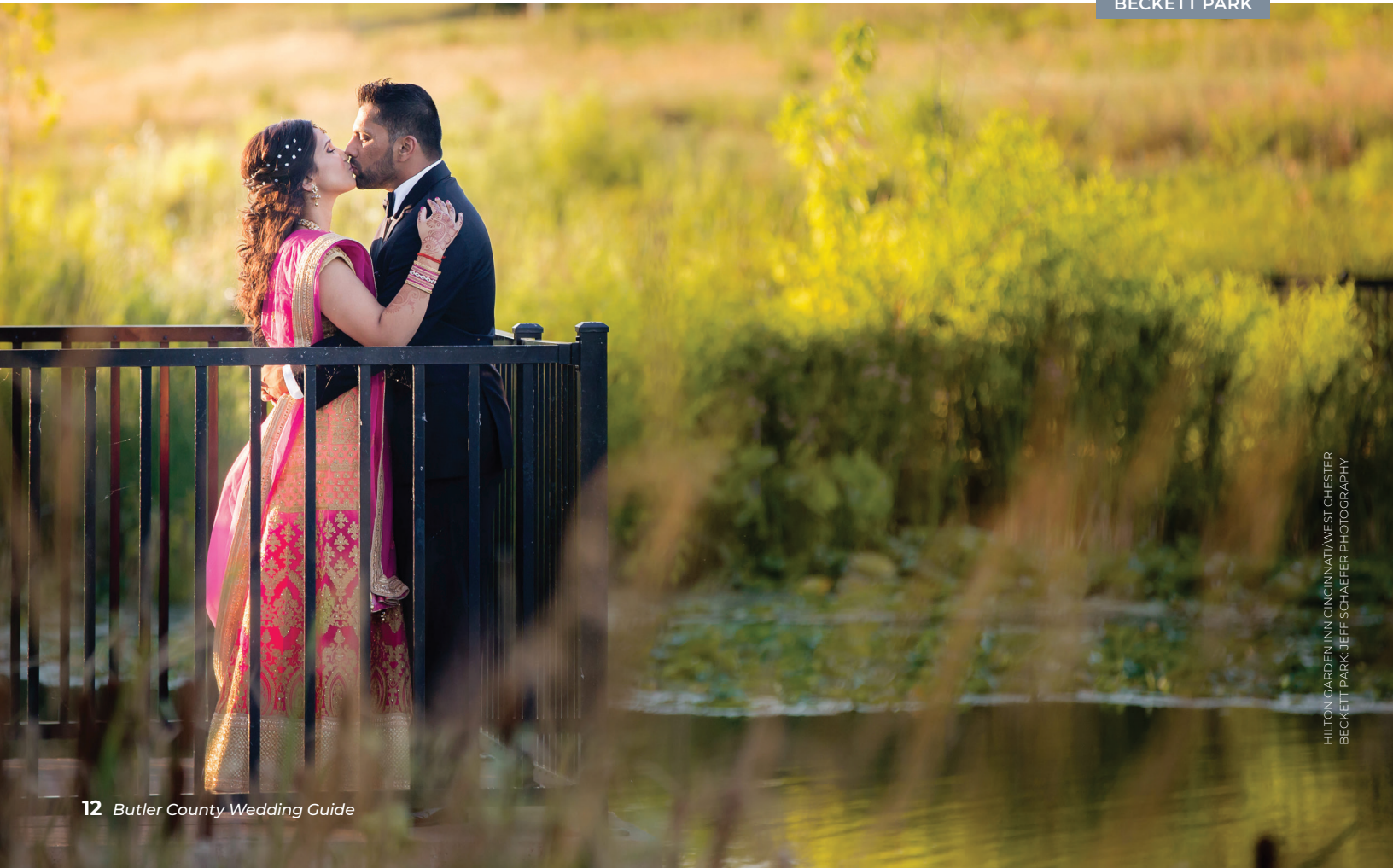
HILTON GARDEN INN CINCINNATI/WEST CHESTER BECKETT PARK