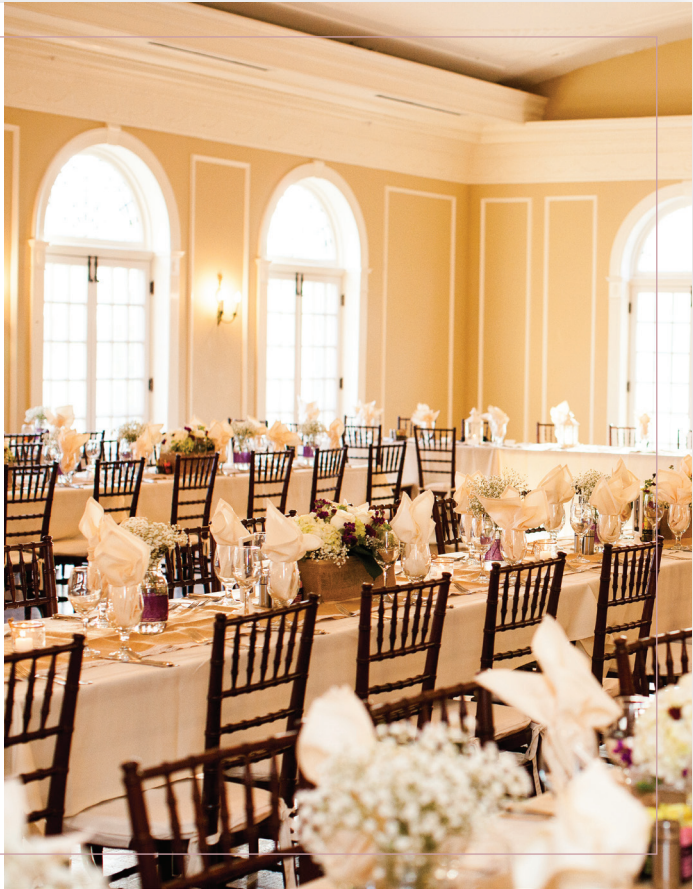
THE OSCAR STATION: JUNGLE JIM'S INTERNATIONAL MARKET OXFORD COMMUNITY ARTS CENTER