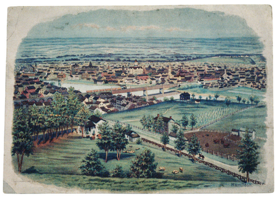
Hamilton, 1890 Lithograph

In the 21st century Butler County and its communities are experiencing significant revitalization. Museums, historic sites, historical societies, history research facilities and related organizations tell its fascinating story. This booklet is a guide to unique architecture, significant artifacts, original documents, changing exhibits and public programs. We encourage you to explore the county's rich history and heritage.